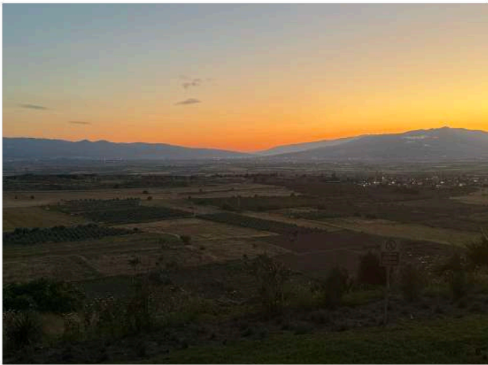
Sunset in Pamukkale