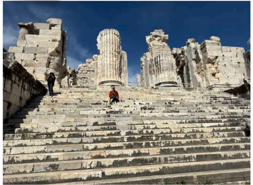
Temple of Apollo, Didyma