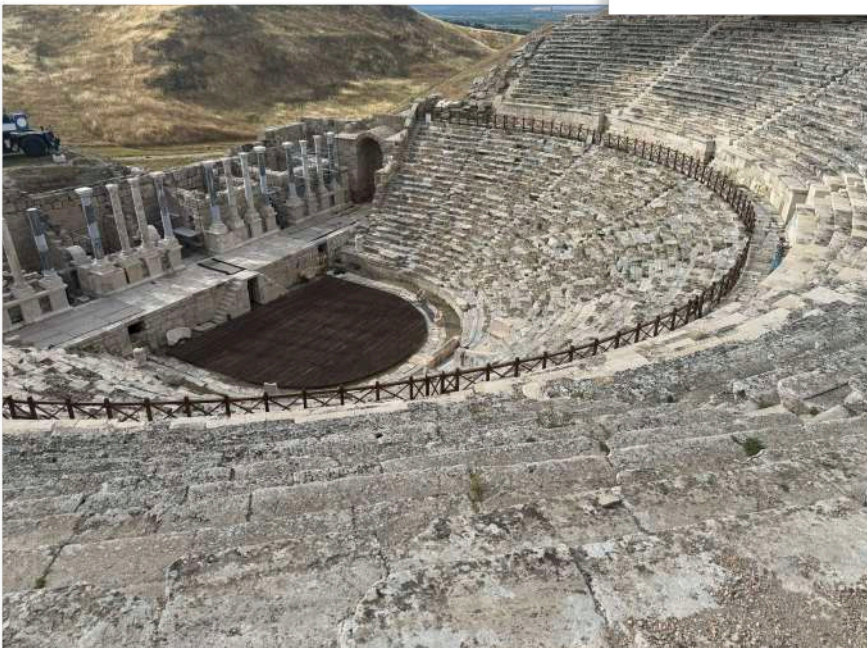
Western Theater, Laodicea