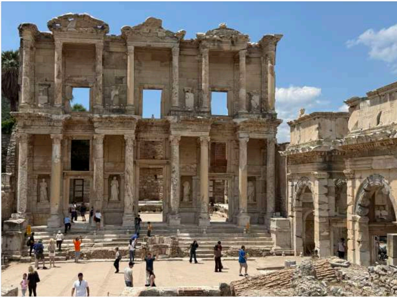
Library of Celsus, Ephesus