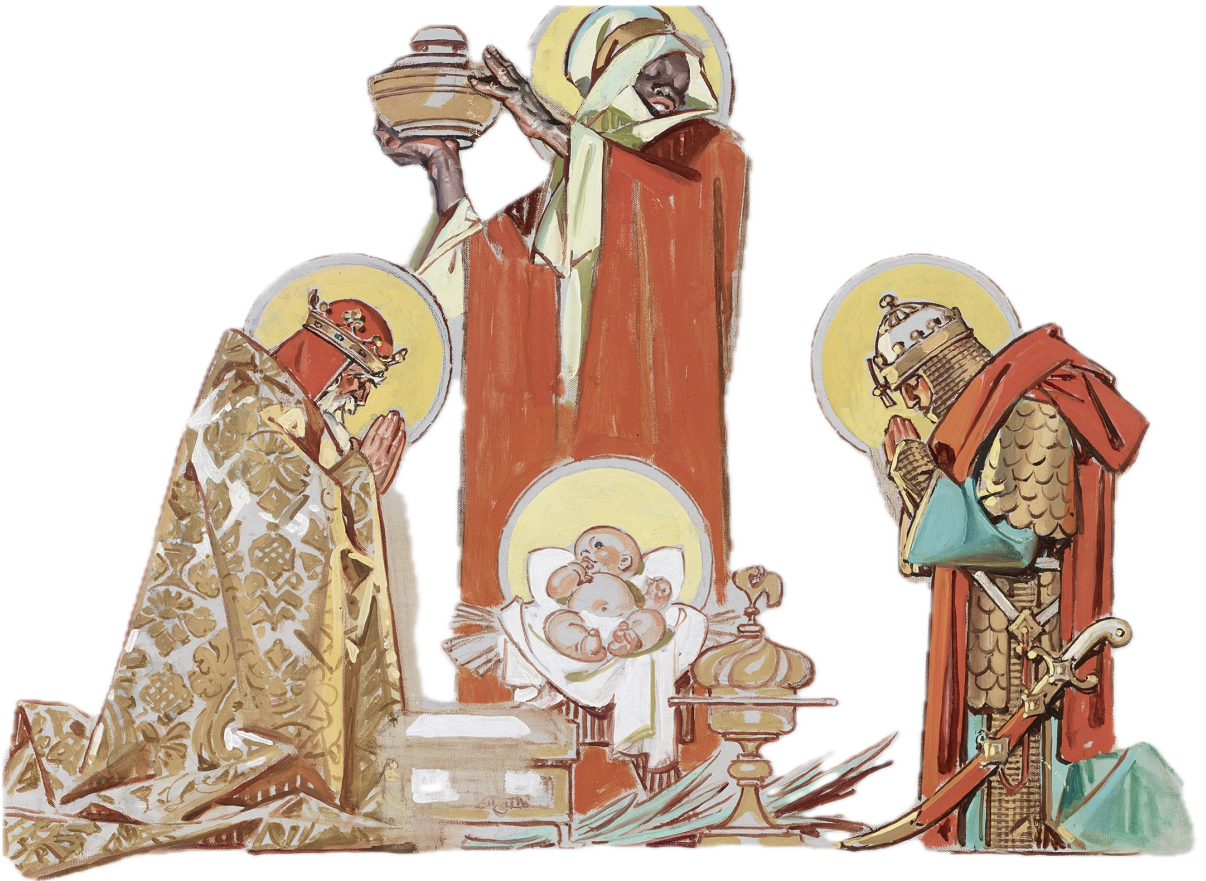
Three Wise Men (Joseph Leyendecker)