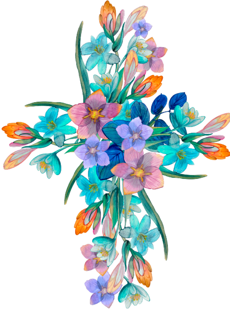
Floral Cross #2 (Svitlana Vorotniak)