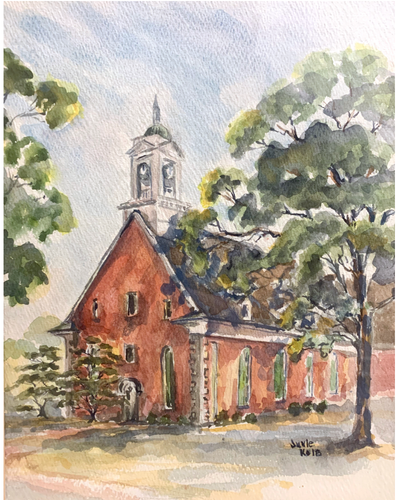
Calvary Moravian Church