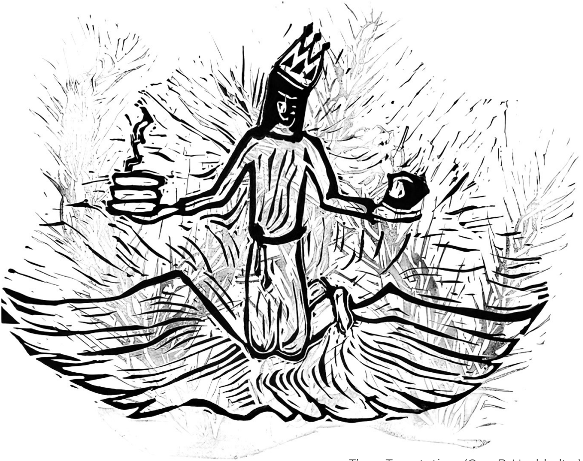
Three Temptations (Cara B. Hochhalter)